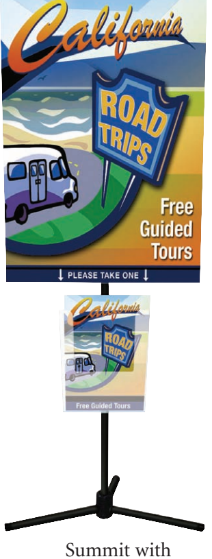
Summit with Combination Graphic and Literature Holder