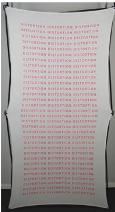
3" in - distortion becomes more apparent