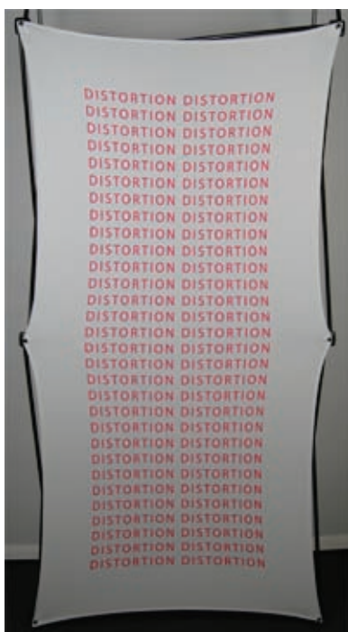
5" in - least amount of distortion