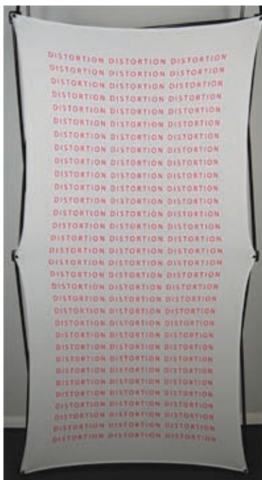
3" in - distortion becomes more apparent