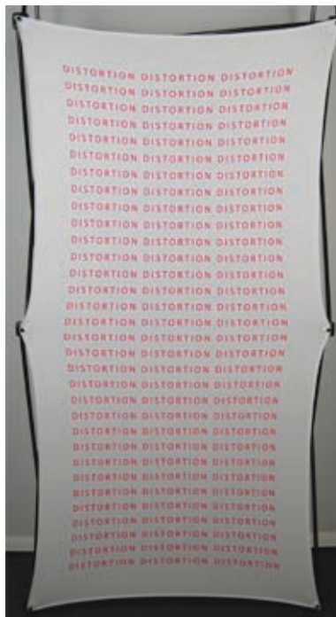
3" in - distortion becomes more apparent