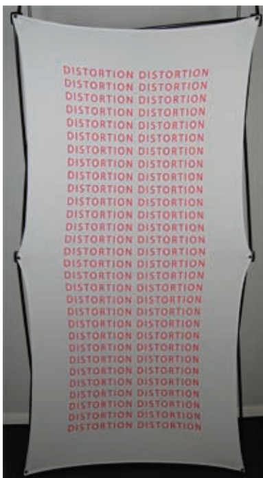
5" in - least amount of distortion