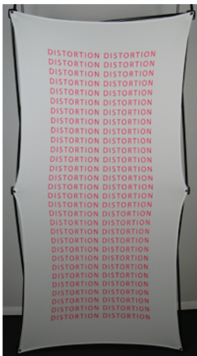
5" in - least amount of distortion