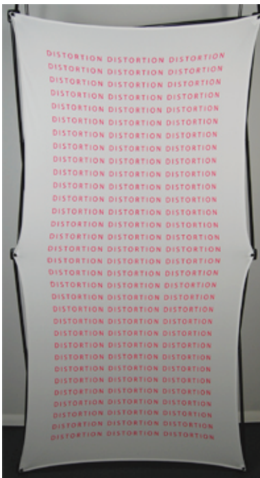
3" in - distortion becomes more apparent